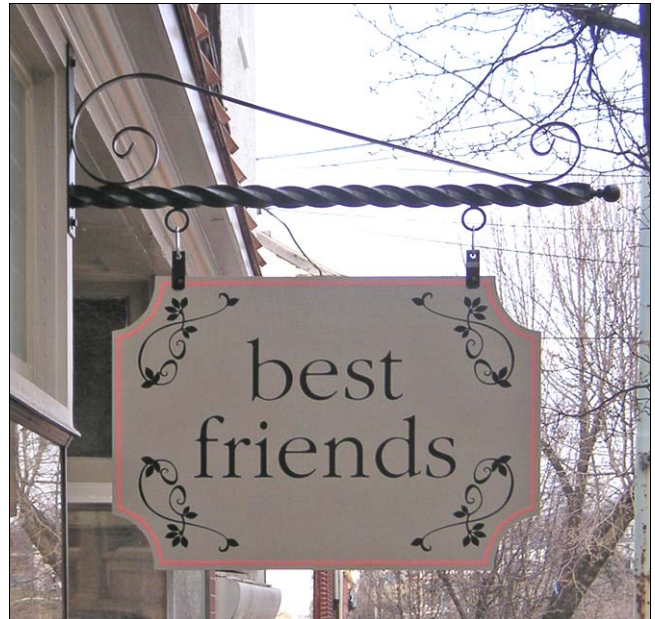
The twisted bracket for this projecting sign is more ornate than most brackets and complements the flower motif on the sign. The hanging hardware is black, making it less visually obtrusive.

Projecting Signs are generally double-faced signs, suspended from a bracket that is mounted perpendicularly to the wall of a building and projects more than 12 inches. The bottom edge of projecting signs should be installed a minimum of eight feet above the walking surface if it is located above a sidewalk or walkway.