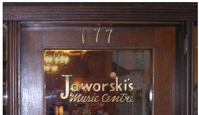
Window signage can be a good alternative to wall mounted signage for a professional office, to identify an entrance or hours of operation.

Window Signs include all signs that are attached to glass either at the interior or exterior of the building. These signs are generally painted, vinyl appliques or etched glass, and can include stained glass. Window signs can include words and logos without a painted background while allowing potential customers to see into the storefront.