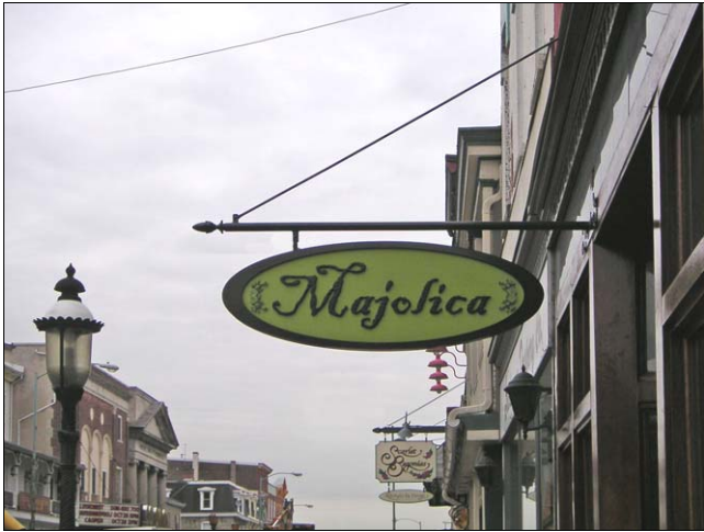
This projecting sign makes use of the ambient lighting provided by the streetlamp.