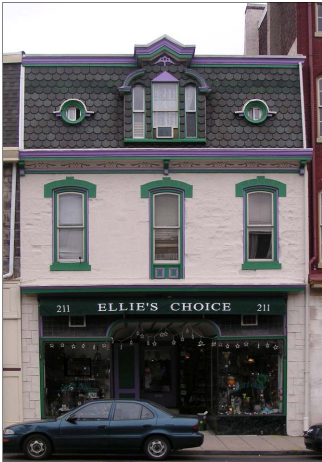
This awning retracts revealing the storefront transom window.

Awning Signs are typically located on the awning valance. In addition to identifying a business, awnings can provide sun damage protection for merchandise and reduce solar heat gain, and are a good option for businesses that are orientated to the south or west.