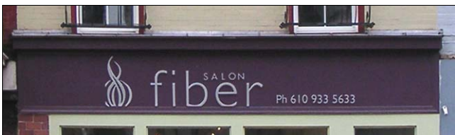
The dark background of the storefront cornice provides a strong contrast to the light colored individual letters and logo of this wall signage. The individual pin-mounted letter installation provides a more modern appearance.

Because most of the buildings within the Phoenixville Downtown Historic District are located along the sidewalk and property line, most of the signs are mounted onto buildings. The following illustrations are intended to provide general examples of the most common sign types that can be found within the Historic District.