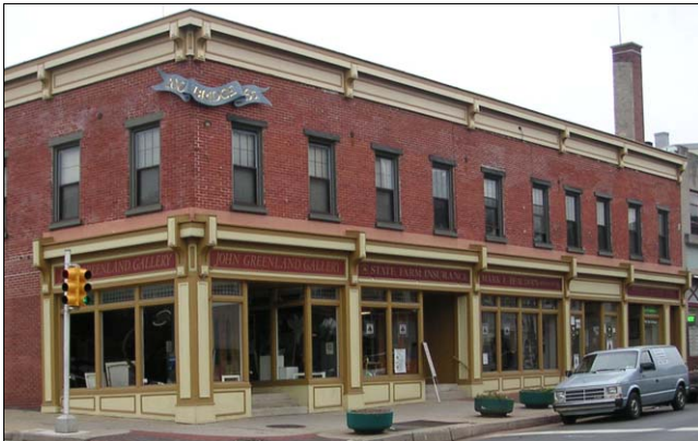
This signs are of a consistent color and design and are all located below the storefront cornice, providing visual continuity.

Within each general style numerous typefaces are available, many of which can be varied by making them bold or italicized. Similar to materials, different styles of lettering were typically utilized for specific periods. Applicants are encouraged to utilize lettering and materials that complement their particular property.