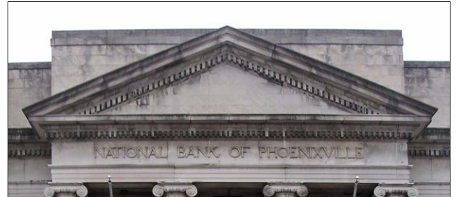
The sign for the National Bank of Phoenixville was carved into the cornice frieze above the entrance.

Directory Signs can be either freestanding or attached to a building. They include information about several businesses on a single larger sign, with an identifying building address and/or building name. The individual nameplates on the sign should match each other in size, colors, letter size, case and styles.