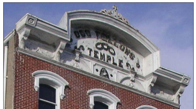
The sign for the Odd Fellows Temple is incorporated into the building cornice.

Historic Signs that are an architectural feature of the building and often reflect the original owner and use for the building.